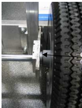
Washers: Thin & Thick